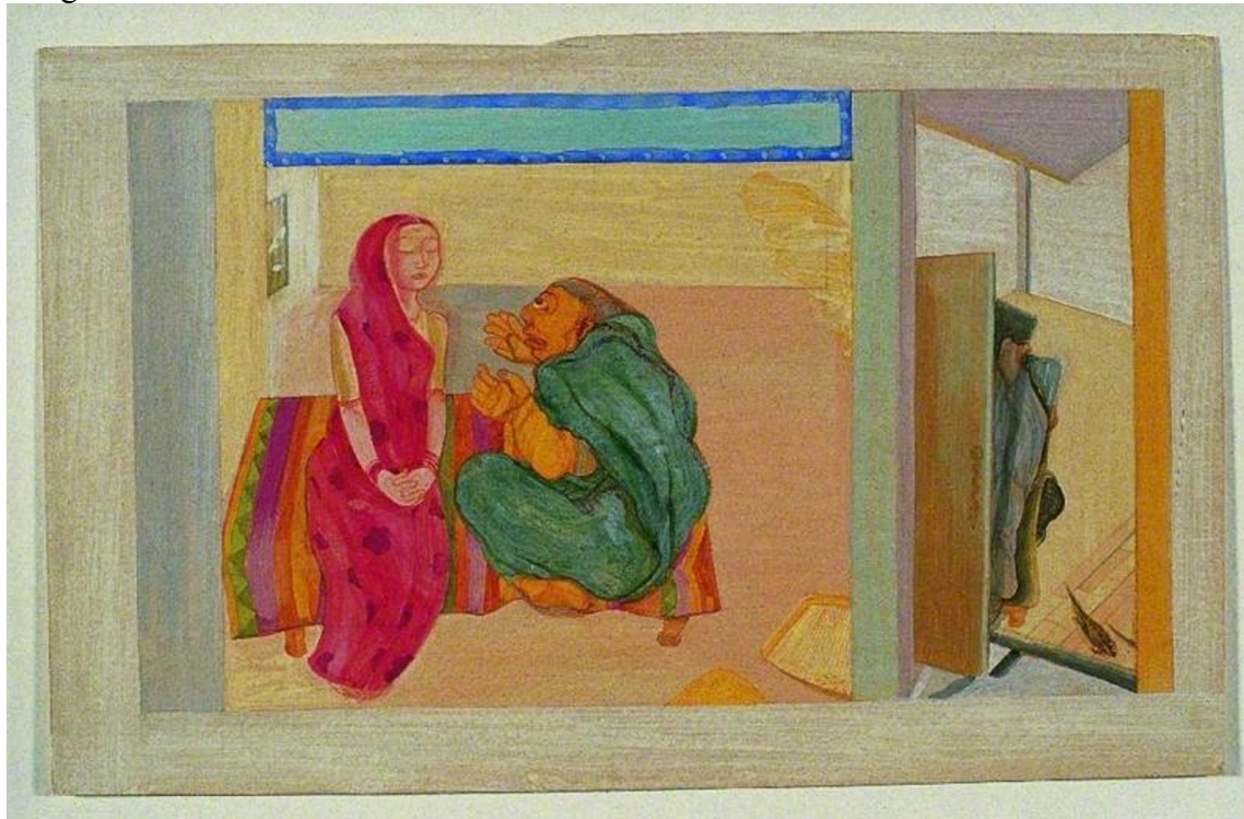
Nilima Sheikh, Conflict between the Daughter-in-Law and Mother-in-Law, while the Husband Enjoys a Rest , 1984. Oil.