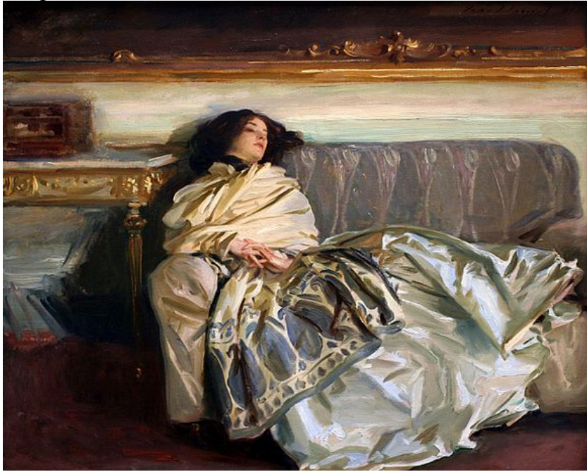
John Singer Sargent, Nonchalair (Repose) , 1911. Oil