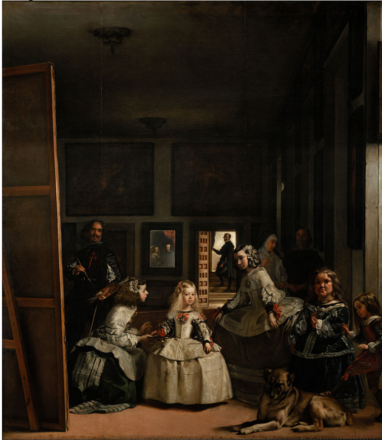
Diego Velázquez, Las Meninas , 1656. Oil