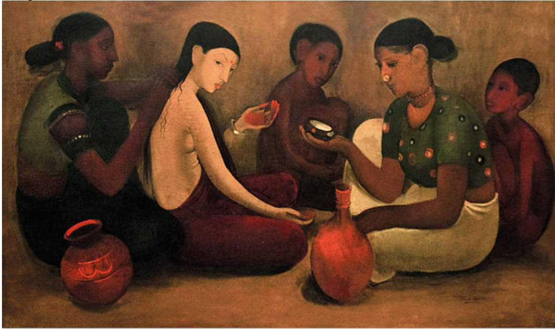
Amrita Sher-Gil, Bride's Toilet , 1937. Oil