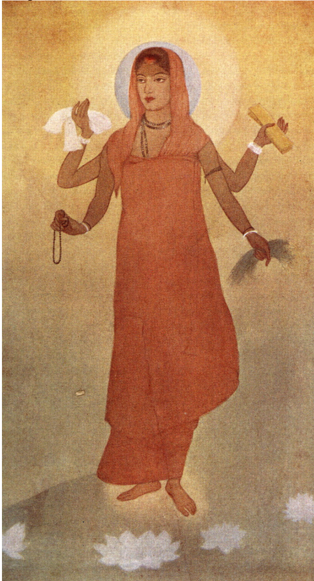
Abanindranath Tagore, Bharat Mata (Mother India), 1905. Watercolor