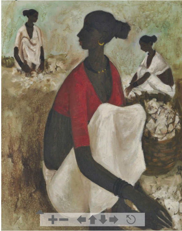
B. Prabha, Untitled (Fisher Women) . Oil