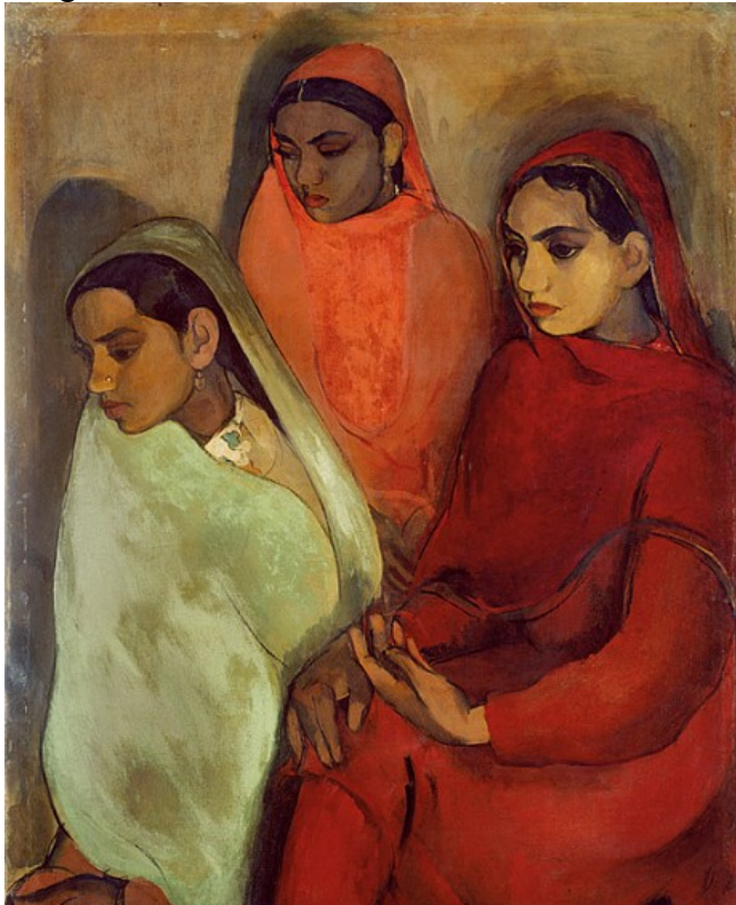
Amrita Sher-Gil, Three Women , 1935. Oil