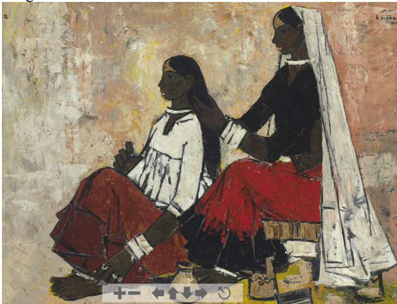
B. Prabha, Untitled , 1933. Oil