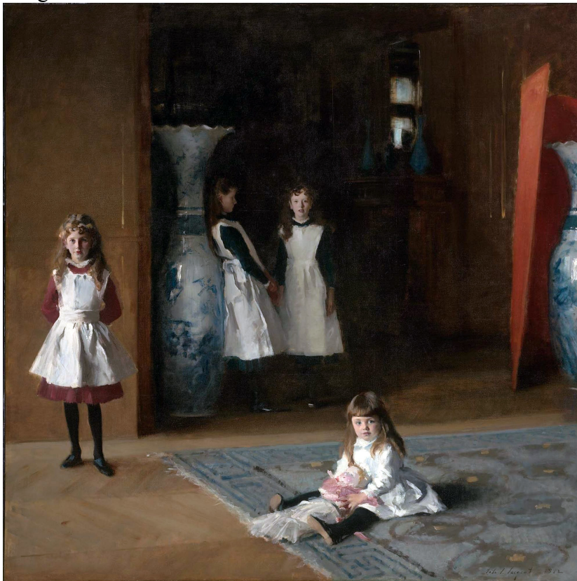
John Singer Sargent, The Daughters of Edward Darley Boit (Portraits d'enfants) , 1882. Oil