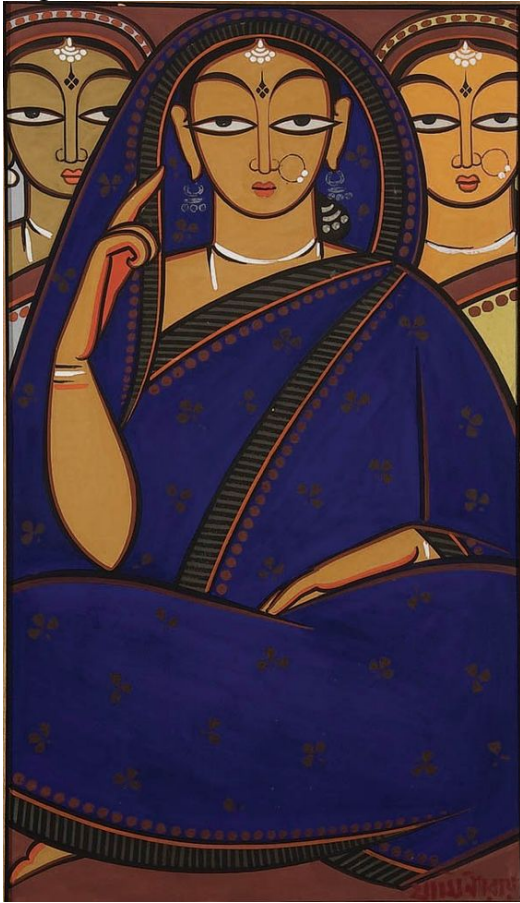
Jamini Roy, Bride and two Companions , 1952. Tempera.